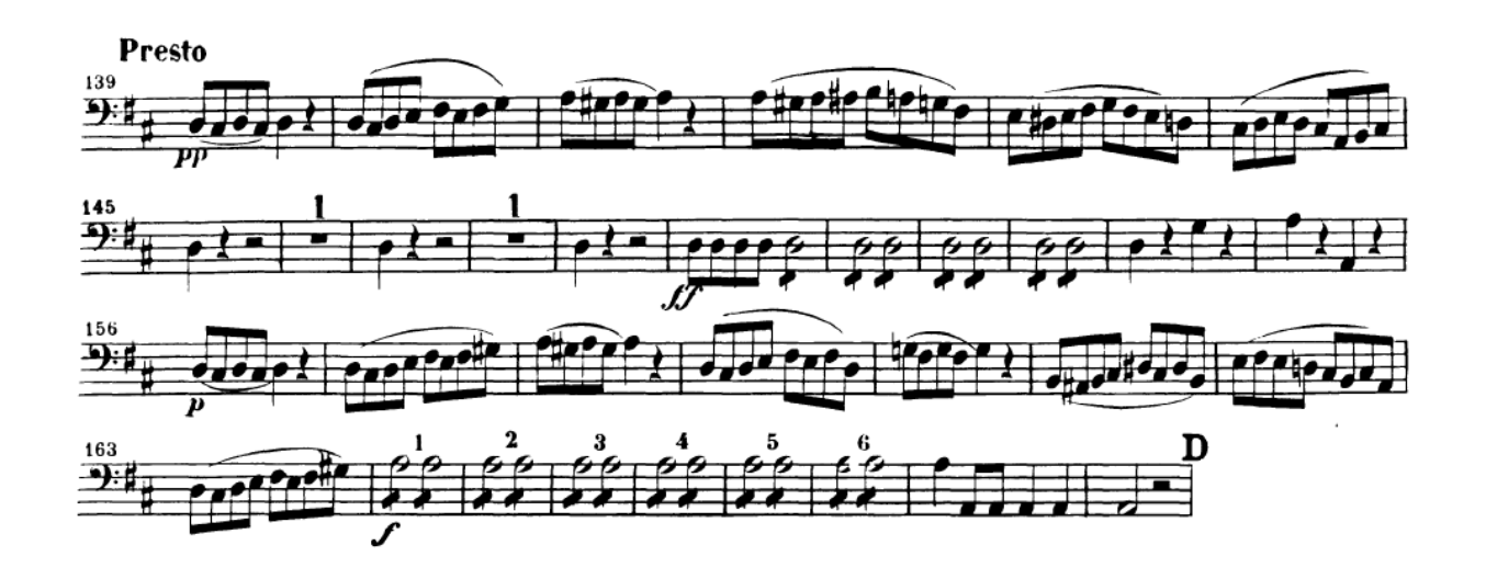
Ravel: Boléro (2–3)

Mozart: Overture to Le nozze di Figaro (139–171)