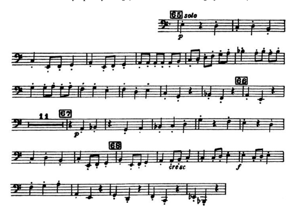
FOR EDUCATIONAL PURPOSES ONLY

Shostakovich : Symphony No. 5 (second movement: 65–9 after 68)